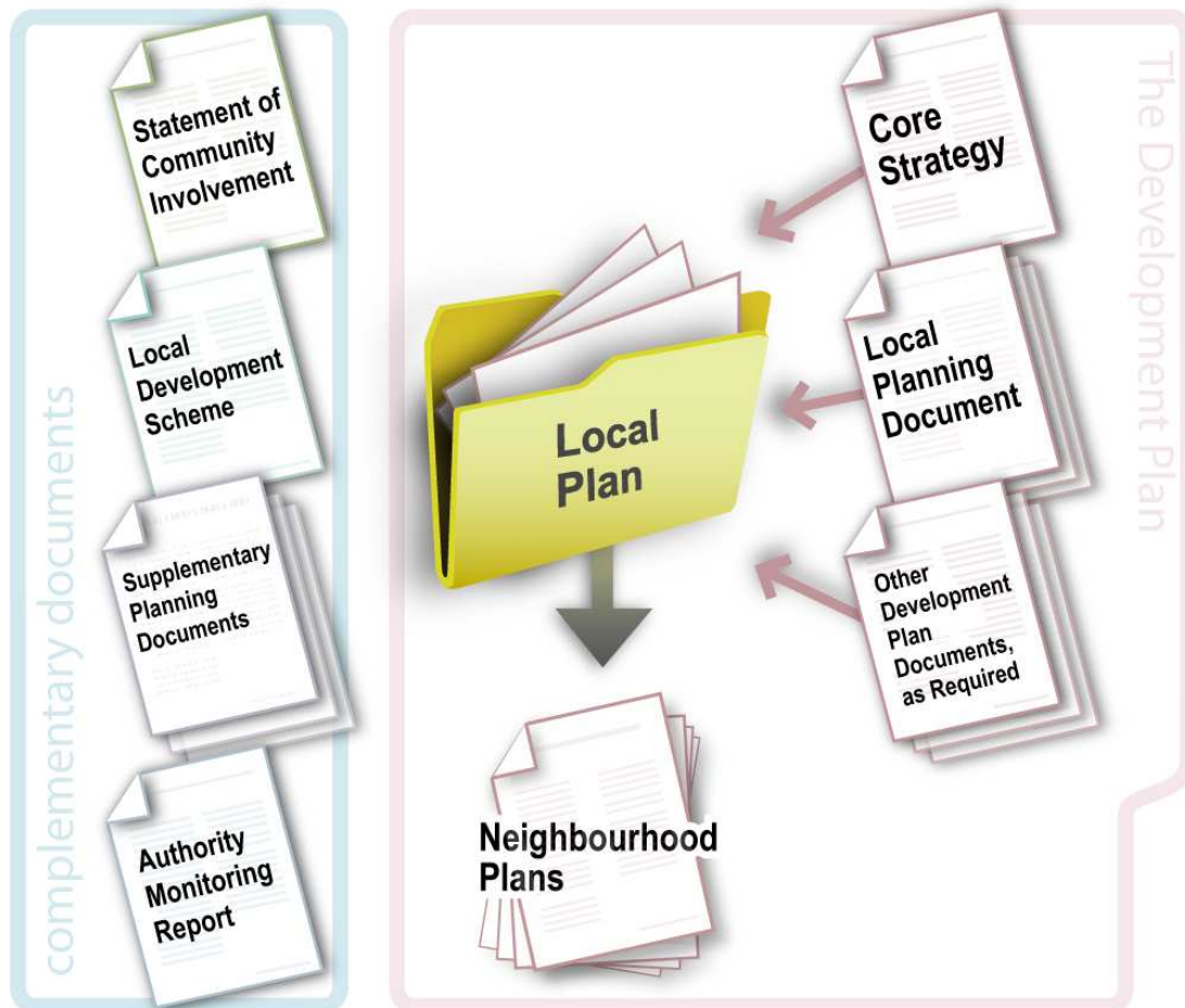
Figure 1: The Local Plan